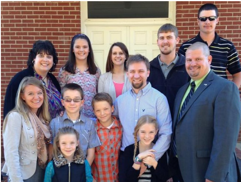
Faith Baptist Family

Then it was back to Michigan for some last minute studying, Thanksgiving with our Michigan family and frantic Christmas decorating before I had to leave on November 29th for the JAARS Center in Waxhaw, NC.