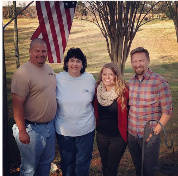
We were blessed to be able to spend Thanksgiving with our Georgia church family.