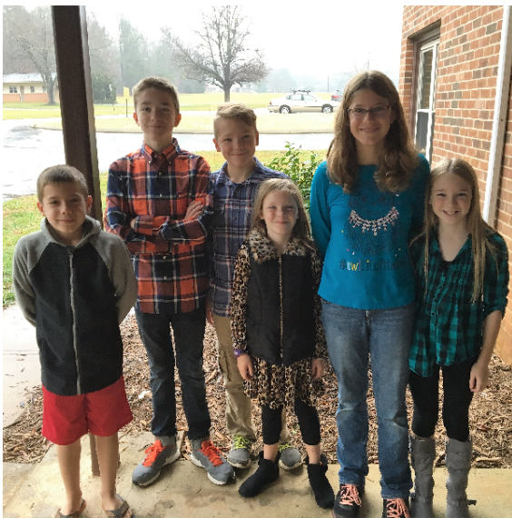
A month later, we were saying goodbye to the friends we had made at JAARS. We are very thankful for how God provided such great friends in a short amount of time!