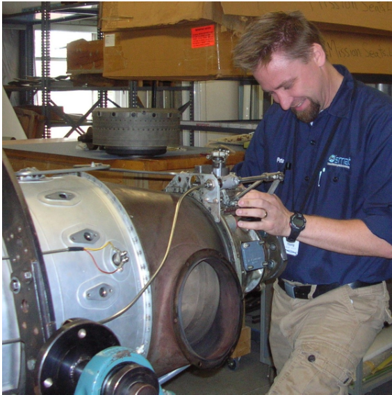
Another highlight of TO was the week-long course on turbine engines.

When I returned from the mountains, we were able to drive out to the coast of NC and visit some members of #TeamYoung. Being close to Kitty Hawk, we had to go visit the birthplace of powered flight!